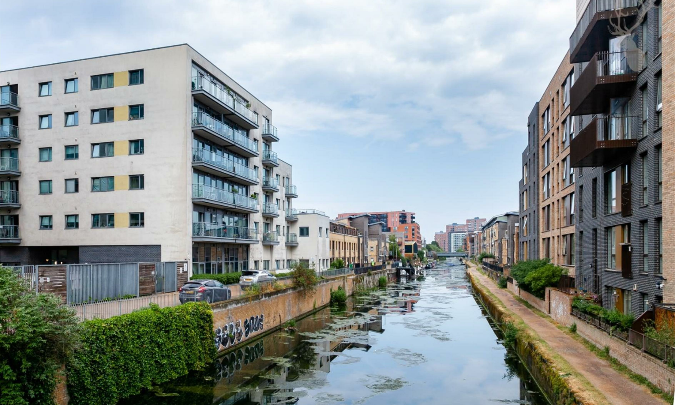
Aqua Vista Square, London, E3